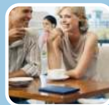
Pay at the Table